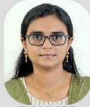
RANK 10 SIBI N