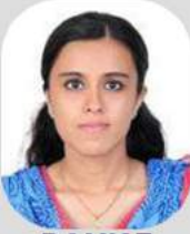
RANK 7 ALFA S S