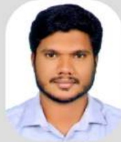
RANK 67 RAMEEZ RAJA