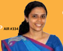
Enlitean Archana PP AIR #334

Individual mentorship, Well targeted Last lap sessions and last minute predictions makes Enlite's Mains Test Series a class apart from the rest.